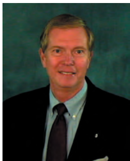
{Inducted into SBD in 1995 at Cumberland University}

Faculty initiative has been largely responsible for SBD taking root and growing into a major international honor society for business management and administration. Their acceptance and enthusiasm for providing honor society opportunity for their students are keys to creation and continuance of institutional chapters. As shown in the three following chapter accounts, the stimulus sometimes comes from one faculty member as at Elizabeth City State University and Virginia Military Institute. Other times it's a collaboration as shown at Rogers State University where the dean, department chair and professor, all with previous SBD experience, collaborated to ensure a successful chapter development. Clearly, the three versions point to faculty involvement as the key ingredient in spreading SBD.