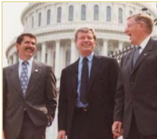
ΣΒΔ's Congressional Delegation

ceremony participation by the state's U.S. Senators and its Representative is significant and unique. Sigma Beta Delta is proud to be represented in the U.S. Congress.