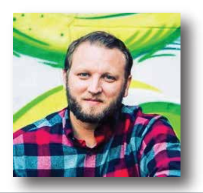
"The certificate and stole are stored away so I can show my daughter, in the future, the reward for hard work and be living proof and a reminder"

It was a very soggy day in Lynchburg, VA. It had rained most of the day and night before, and it was still raining on the morning of May 18th, 2018. Many ceremonies and graduations were scheduled for that day at Liberty University. Such a joyous day did not deserve the rain and clouds that rolled through the Blue Ridge Mountains. But, the rain didn't discourage the students and faculty nor their friends and family as they began to arrive on campus. Many of the guests that day arrived with colorful flowers and dazzling balloons to push against the grey of the day and to give to their loved ones in recognition of their academic achievements.