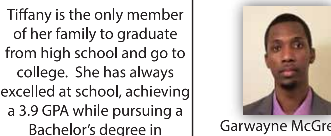
Garwayne McGregor College of Westchester White Plains, NY